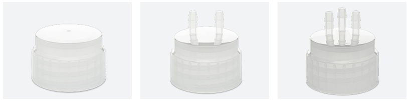
Cap - no tubing