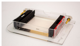
Run DNA gels in 20 min