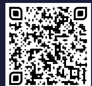
Discover our solutions